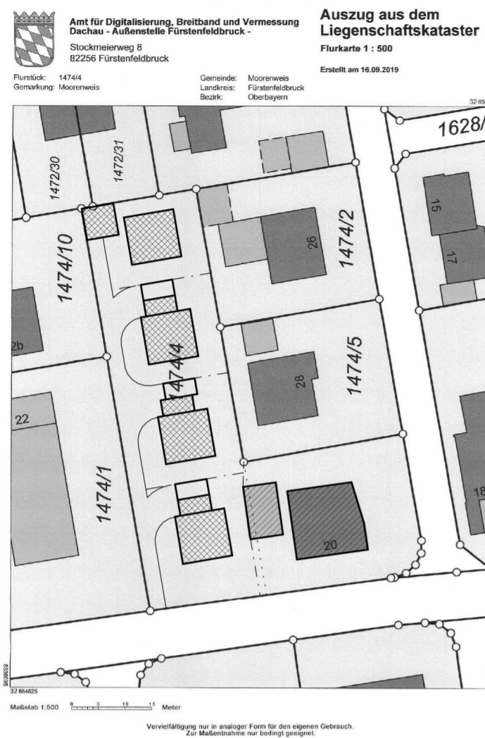
Lageplan M 1:1000